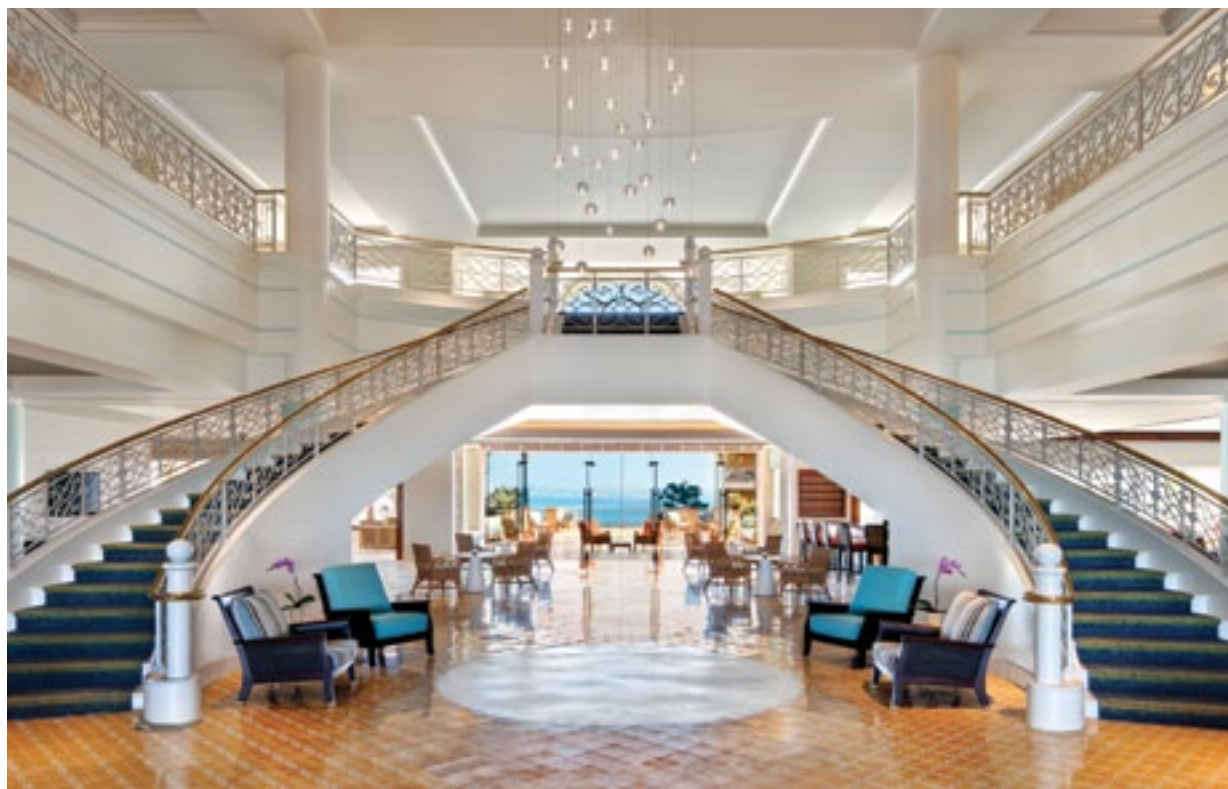
LOEW'S SAN DIEGO GRAND STAIRCASE

Tremendous technology changes in recent years have made exponential leaps in the way we will communicate, interact and transact with each other for generations to come. The Internet of Things (IoT) has brought about the potential for low cost sensors on everything around us, on us and even in us. Blockchains and smart contracts with advances in encryption tools will provide for the immutable trust and transparency required to build the foundation of Web 3.0. The collection of all this data will provide startling context to how we behave and make decisions through Better Data Analytics. Advances in Artificial Intelligence through machine learning will change the way we interact with machines, our environment and each other forever. What does this mean to your business? What are the technology risks? We have now entered the Transformative Age – are you ready to do business in the future?