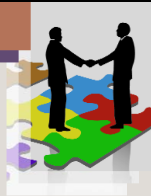
Exhibit your firm's essential tool and resource solutions at our FIRMA National Risk Management Training Conferences